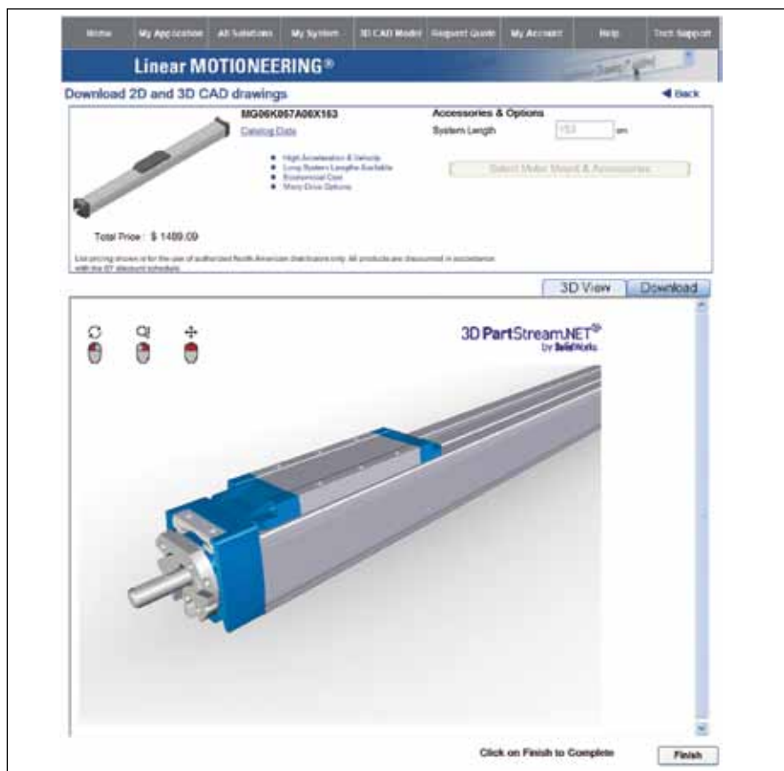
Linear Motioneering from Thomson is a web-based sizing and selection tool that reduces the time required to utilize economical and proven standard components to meet the vast majority of linear motion requirements.

No, if anything, the motor-driven slide table is replacing existing applications that are based on hydraulic or pneumatic technology. Servo motor and position feedback technology are at a more competitive cost point. They offer benefits of better control, safety and environmental friendliness.