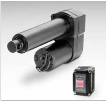
Electromechanical linear actuators, such as the Electrak Pro Series from Thomson, are those that are derived from flexible platforms customized to meet the needs of specific OEM customers.

claim the same performance numbers per the same standard, but the two bearings will not have equal performance. Ultimately, it is the degree of trust you have in the linear bearing manufacturer, because not all linear bearings are created equal.