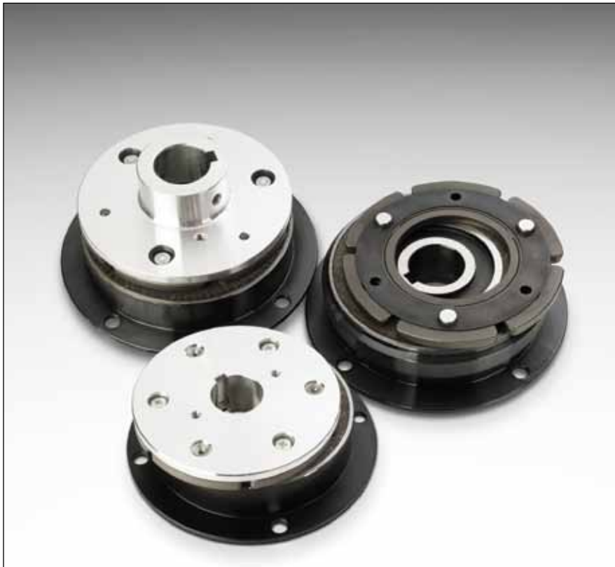
Deltran high-performance solution in OEM or after-market applications. Their higher torque rating enables users to install a smaller, less expensive unit than would otherwise be possible with competitive options.