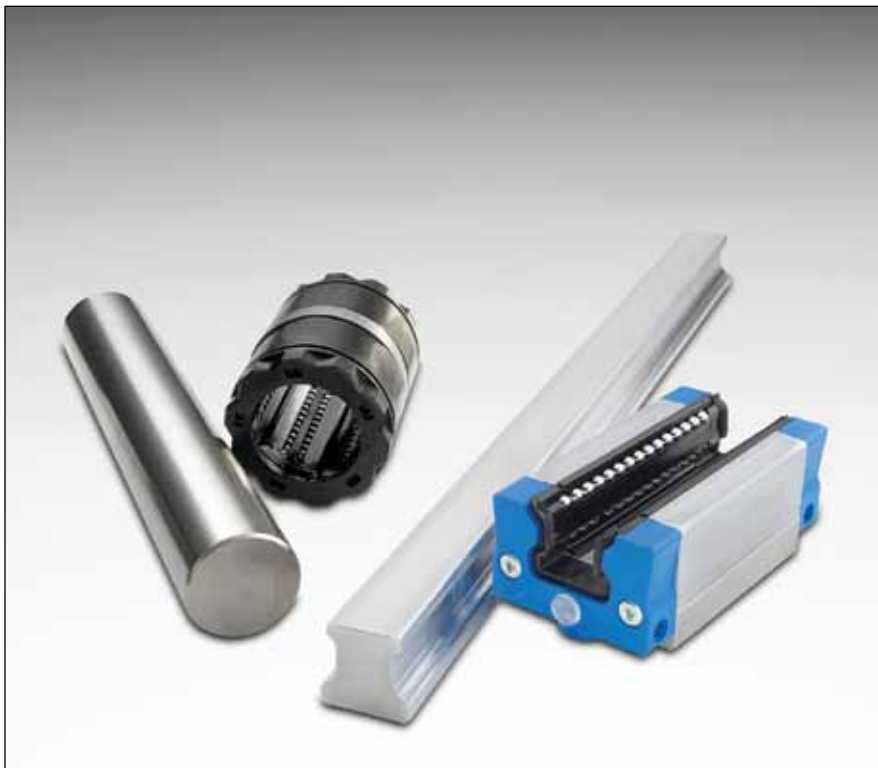
The two major types of linear guides are round rail bushing bearings and profile rail bearings. Round rail ball bushing bearing systems accommodate torsional misalignment caused by inaccuracies in carriage or base machining or machine deflection with little increase in stress to the bearing components. Profile or square rail systems offer higher accuracy, higher rigidity, higher load-life capacity and are also very compact.

Power-off, spring-set brakes will participate in this expanding market segment for parking and safety.