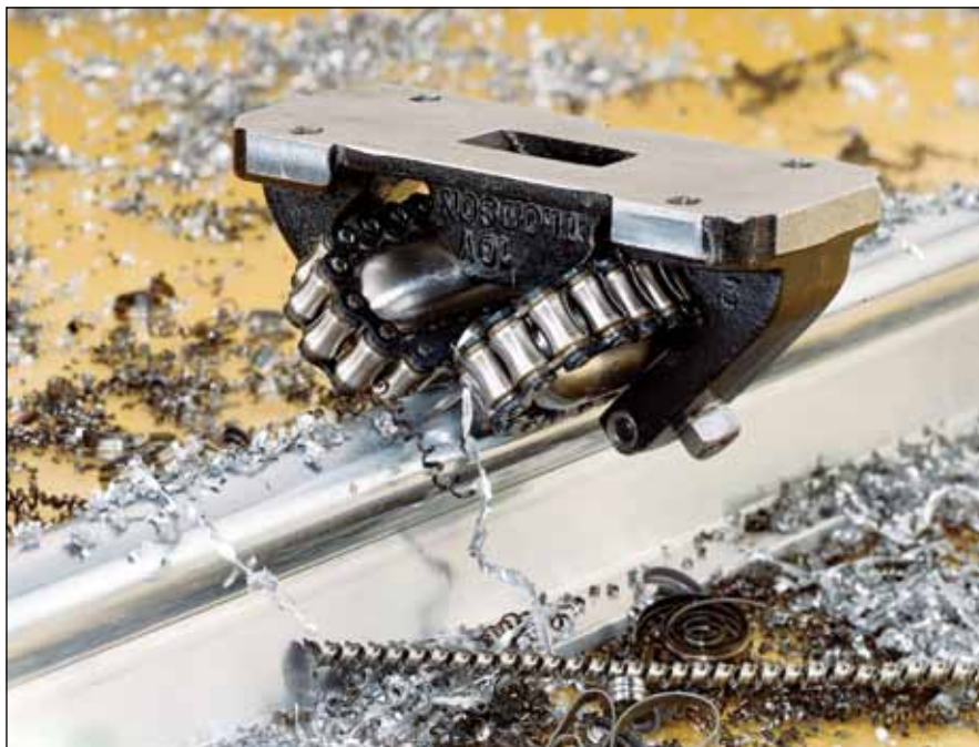
Thomson RoundWay Linear Roller Bearings boast a dynamic load capacity of up to 70,000 lbf (310,800 N)—more than 20 times the load capacity of a conventional linear ball bearing, even at extreme operating temperatures (up to 500 degrees Fahrenheit; 260 degrees Celsius) and speeds (up to 100 ft/s; 31 m/s).

On a longer time scale, as mentioned before, compliant designs and structures have been introduced to help