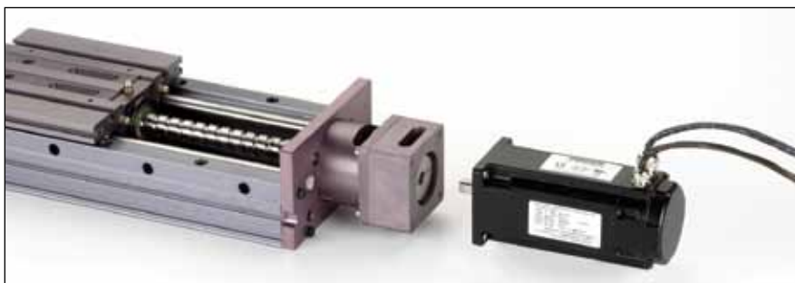
The Thomson RediMount System provides mounting to virtually any customer-specified motor. It eliminates the need for a custom motor adapter, greatly reducing cost and delivery time (all photos courtesy Thomson Systems).

A motor mounting system that is designed to mount to a wide array of motor interface dimensions—yet be flexible enough to produce the interface in 24 hours—has addressed this need. Lastly, there are software tools that have been developed to take the input